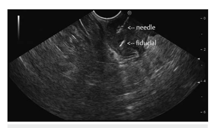
▶ Fig. 1 Fiducial placed under EUS-guidance.

after placement) and MRI artifacts caused by the clips [9,10]. This led to exploration of the feasibility of fiducials, as they are more frequently compatible with MRI and appear to stay in place in other organs. A first report by Vorwerk et al. on rigid rectoscopy for placement of fiducials in the mesorectal tissue of nine patients with rectal cancer demonstrated 100% retention rates in the first 5 weeks after placement [15]. A consecutive study of EUS-guided endoscopic placement of intratumoral fiducials in 11 patients resulted in a fiducial retention rate of 74% at the time of surgery [14].