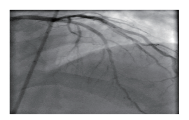
Figure 4. Post LAD stenting.

Four theories have been proposed as a patho-physiologic mechanism. The first [1, 9] suggests that CC is a referred pain, as there is a connection between the central cardiac pathway (vagus nerve) and the cranial pain afferents (trigeminal nerve) in the upper part of the spinal cord. The second theory [1] proposes that CC is secondary to elevated intracranial pressure due to venous stasis caused by transient decrease in cardiac output due to ischemic ventricular dysfunction. According to