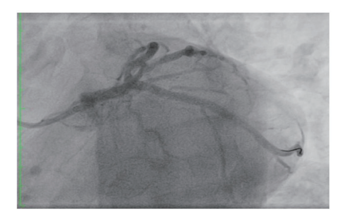
Figure 6. Post LCX stenting.