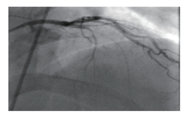
Figure 3. Totally occluded LAD.

severe and has been described as having different characteristics. There may or may not be other accompanying symptoms and if there are, 30% may be autonomic in nature. In 27% of the cases headache is the only manifestation of a cardiovascular ischemia. The headache starts immediately after physical exertion or on stress, and disappears gradually after resting. In 33% of cases headache appeared at rest. The frequency of this headache is highly variable and is concomitant with the acute cardiovascular event. Fifty-seven percent of patients show ECG abnormalities at rest [4] as well as elevated cardiac enzymes [5], and in the remaining ECG changes appear only during stress [6].