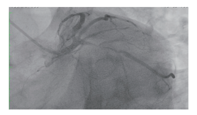
Figure 5. Severe proximal LCX lesion.

third theory [1], it may be secondary to the local release in the heart muscle of chemical mediators capable of inducing remote pain, in this case headache. Among others, serotonin, bradykinin, histamine and substance P have been proposed as potential pain producing substances. The increase in intracardiac pressure during angina attacks could also result in release of natriuretic peptides with consequent vasodilatation of the cerebral vasculature resulting in headache. Finally CC could be due to the concomitant presence of vasospasm in both coronary and cerebral vascular beds [10]. When the headache occurs as the only manifestation of an acute coronary event, the diagnosis could be difficult; useful clues are older age at onset, no previous history of headaches, and presence of risk factors for cardiovascular disease and the onset of headache under stress. Knowledge of CC is scarce and it is very under recognized and under reported.