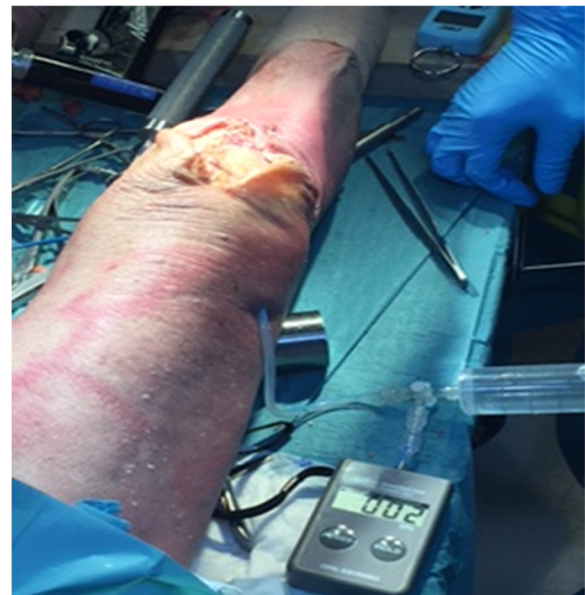
Fig. 2 After capsule closure, saline was injected in a retrograde manner into the knee joint through a drain, which was connected to a manometer, until saline leaked from the joint

In all groups, arthrotomy closure survived without rupture after 10 cycles of 140° knee flexion. Mean infusion volumes were 13.0 \pm 7.2 ml, 38.6 \pm 10.7 ml, and 5.1 \pm 2.5 ml in groups BS-8N, BS-15N, and C, respectively. Mean intra-articular pressures were 0.67 \pm 0.47 kPa, 9.44 \pm 4.55 kPa, and 0.56 \pm 0.44 kPa in groups BS-8N, BS-15N, and C, respectively. Mean infusion volume was significantly higher in group BS-15N than in group BS-8N ( p = 0.008 ). Mean intra-articular pressure was significantly higher in group BS-15N than in group BS-8N ( p = 0.04 ) (Fig. 3).