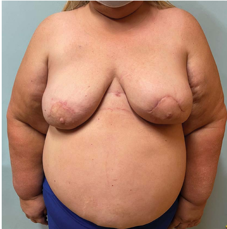
Fig. 4. Four month postoperative result after MSLD reconstruction of the left breast. Her left mastectomy incision closed without incident. Her reconstructed left breast is now slightly larger than her right and therefore provides more volume than the largest prosthetics available. Given the prepectoral right breast implant reconstruction and its ptotic positioning, there is excellent symmetry with the purely autologous left breast reconstruction. This symmetry would not be possible with a right breast subpectoral implant reconstruction.

age was 56.2 years (range, 37–75 years), and BMI was 43.4 kg/m 2 (range, 40.4–55.7 kg/m 2 ). The average flap dimensions were 15.5 cm (range, 11–18 cm) by 38.2 cm (range, 31–50 cm). Eight (40%) patients were diabetics and fifteen (60%) were hypertensive.