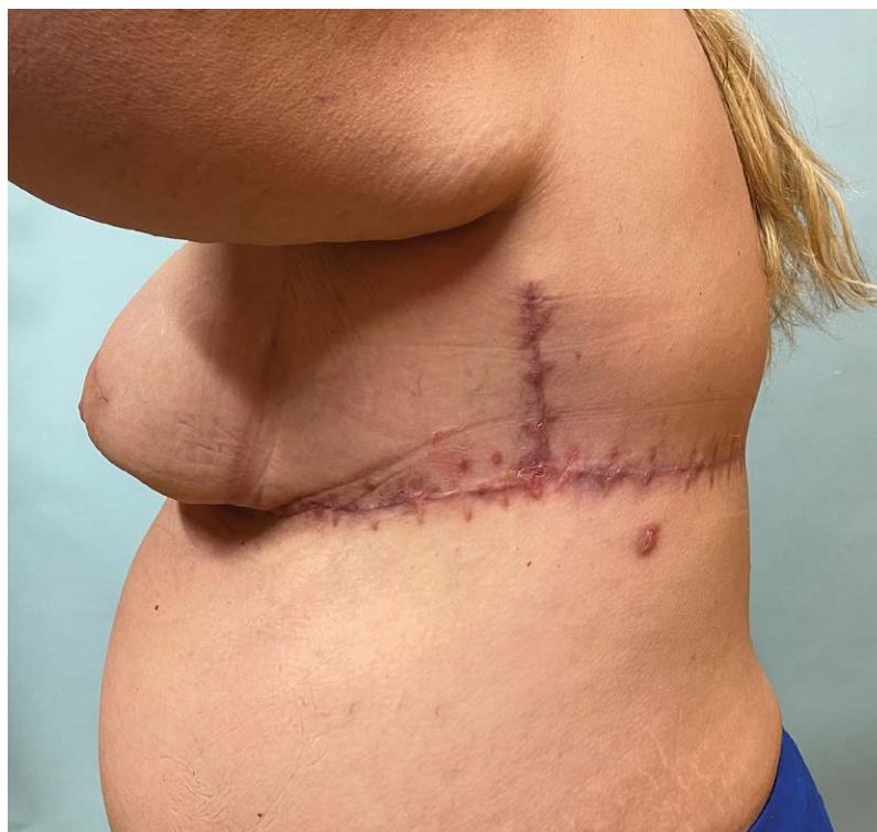
Fig. 3. Postoperative donor site scarring demonstrating the extra vertical scar in the posterior axillary line where tissue is taken to include additional proximal perforators to the flap to increase blood flow. In these larger woman, this scar heals well and is relatively inconspicuous when their arms are by their sides.