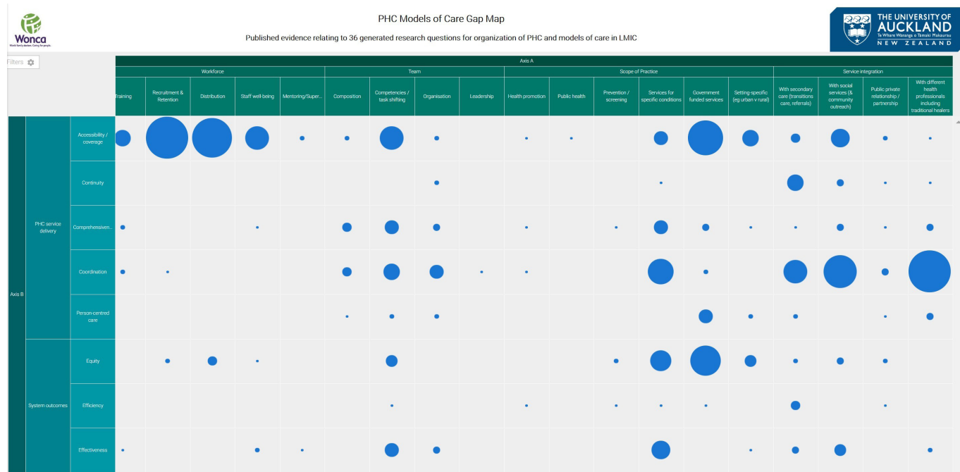
Figure 3 Static version of gap map of studies for model of care.

question were coded for two axes. Seven global regions (Europe, Eastern Mediterranean, Asia Pacific, South Asia, Africa, North America, South America) and a list of all LMICs were included as filters for the map.