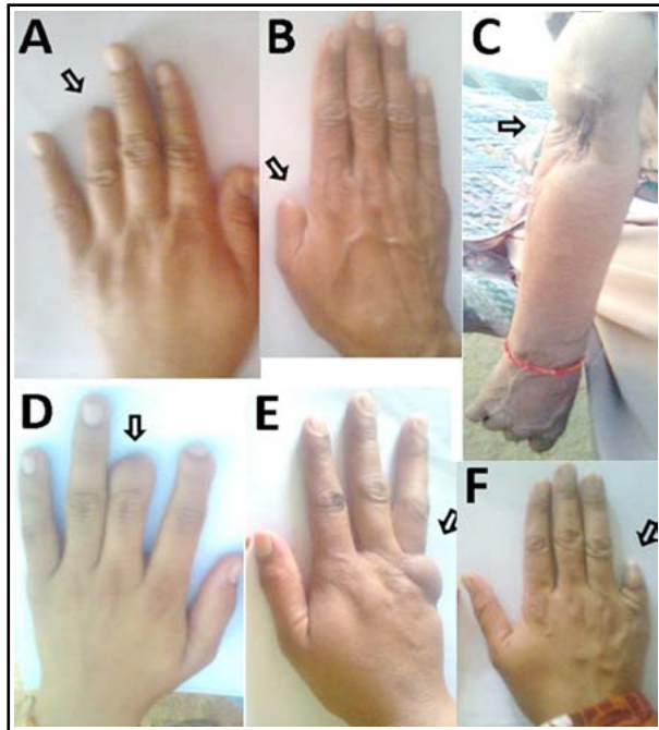
Fig-I: A,B,D. Terminal phalangeal amputations of 4th, 1st and 3rd digits in subjects# 9, 8 and 12, respectively. C. Firearm associated trauma in subject# 13 resulting in non-functional passively hanging arm which also had bluish appearance. E. Postaxial amputation of last digit in subject# 11. Post-traumatic healing and edema is visible. F. Postaxial amputation at the level of proximal phalange in subject# 10.