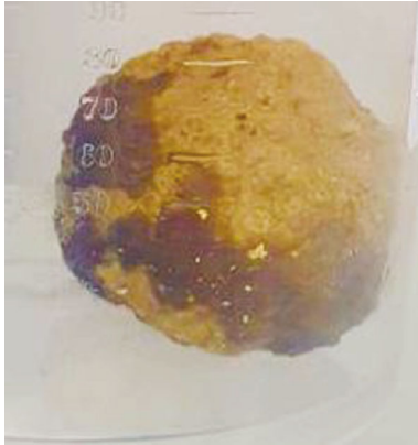
FIGURE 2: Stone extracted from the small bowel (1.8 cm).

was distended with generalised abdominal tenderness on examination, worst in the epigastrium and right upper quadrant without peritonism.