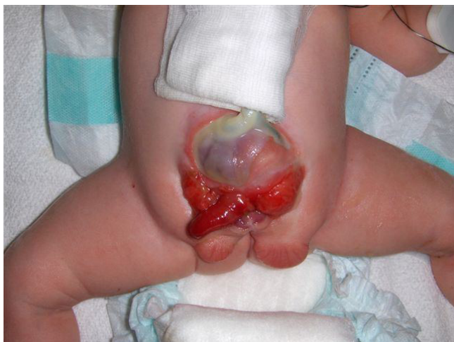
Figure 5 Male newborn with cloacal bladder exstrophy.