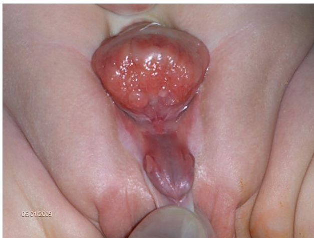
Figure 1 Male baby with classical bladder exstrophy.

Exstrophy variants include a clinically inhomogeneous spectrum. The covered exstrophy appears similar to the CEB, just some part of the reddish bladder mucosa may have a roof of skin, for instance. An umbilicus might be at an orthotopic place. Pseudo-exstrophy, however, may be very difficult to define after birth and is therefore often found at older ages. The genitalia look normal, the patients may not have any urinary symptoms and furthermore are completely continent. Clinical inspection may