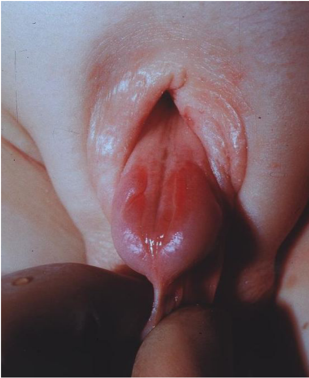
Figure 3 Male baby with epispiadias.

find a rectus diastasis of various degree and only X-rays may demonstrate an open symphysis diastasis, not seldom as an incidental finding.