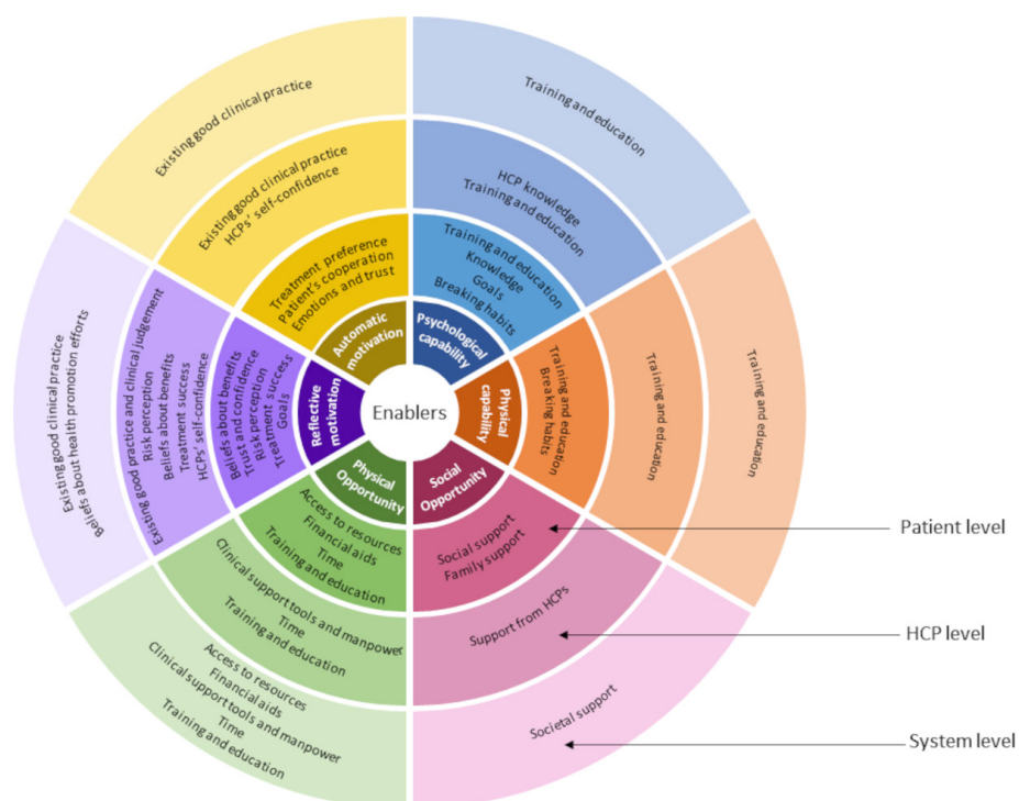
Figure 2 Enablers toward pre-diabetes management at patient, HCPs and system levels.

‘Reflective motivation’ was the most identified component within the COM-B model, with factors mapped to TDF domains such as ‘social/professional role and