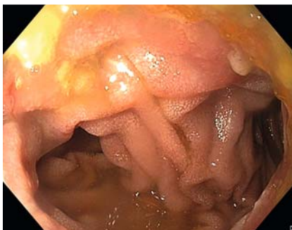
► Fig. 2 Endoscopic view from the stomach into two loops of the jejunum 4 months after creating the anastomosis.

Endoscopic ultrasound-guided gastroenterostomy (EUS-GE) using a lumen-apposing metal stent (LAMS) is a novel endoscopic technique for treating gastric outlet obstruction and represents an alternative to stenting or surgery [1,2]. EUS-GE is minimally invasive and compares favorably with long-term surgical outcomes [1,2]. Several studies report a high degree of technical and clinical suc-