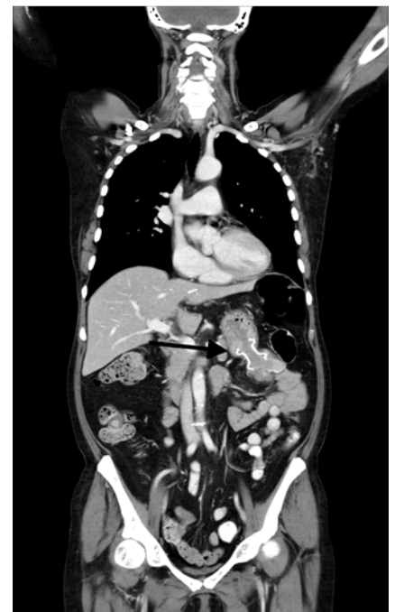
► Fig. 3 Computed tomography scan showing communication between the stomach and colon (arrow).

However, 4 months later, the patient complained of dyspeptic symptoms. Gastroscopy was performed, revealing a normal anastomosis with two jejunal loops (► Fig. 2 , ► Video 1 ). Then, 2 months later, gradual development of anorexia, diarrhea, and fecal vomiting was observed. A computed tomography scan indicated possible communication of the stent with the colon (► Fig. 3 , ► Video 1 ). Gastroscopy showed a patent anastomosis between the stomach and jejunum as well as the large intestine. We extracted