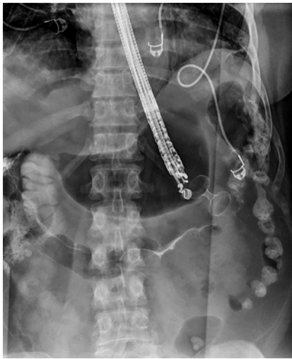
► Fig. 1 Fluoroscopy image showing the correct placement of a lumen-apposing metal stent during endoscopic ultrasound-guided gastroenterostomy. The anastomosis was created between the stomach and the proximal jejunum.