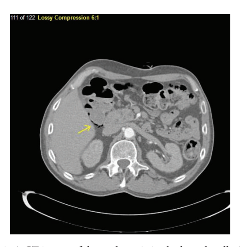
FIGURE 2: A CT image of dependent air in the bowel wall of Patient 1.

A CT scan was obtained to confirm the findings (Figure 2). The patient was asymptomatic at that time, and he was followed conservatively. His chemotherapy and cetuximab were discontinued. Although he did not report any abdominal discomfort or other symptoms that would suggest bowel necrosis, it is unknown if PI resolved as his disease locally in the head and neck and in the lung showed continued progression, and he was eventually referred to Hospice.