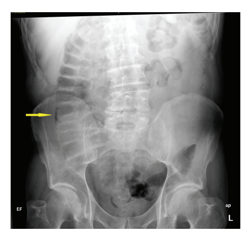
FIGURE 1: An abdominal X-ray showing pneumatosis intestinalis in the ascending colon of Patient 1.