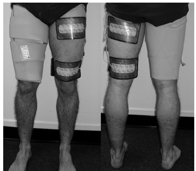
Figure 1 Four large hydrogel electrodes are applied to the skin of each thigh using a neoprene wrap. The electrodes were pre-wired and mounted inside the wrap. The model's left leg is without the garment to illustrate electrode positioning.

The eight participants were asked to train with the NMES, unsupervised, at home, for 45 min to 1 h, six evenings a week, for eight weeks. All patients received at least 6-weeks training. (One patient was measured in the seventh week due to unexpected and unavoidable foreign travel. One missed several days training in the last week due to NMES unit failure.) Self-reported compliance was at least five times per week on average for all participants. The NMES unit had a built-in crude compliance monitor that would be supportive of the participants' stated usage levels. Whenever possible, they were instructed to train after their evening meal and not to eat prior to bed. There were no other dietary restrictions, lifestyle changes or medication changes required.