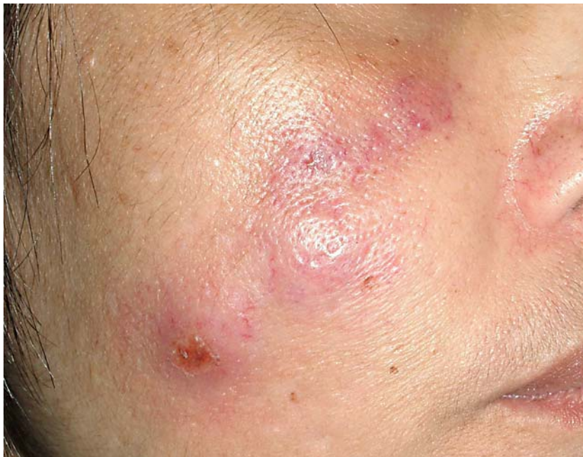
Fig. 1. Erythematous nodules and plaques on the right cheek.