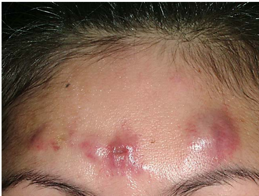
Fig. 2. Erythematous nodules and plaques on the forehead.