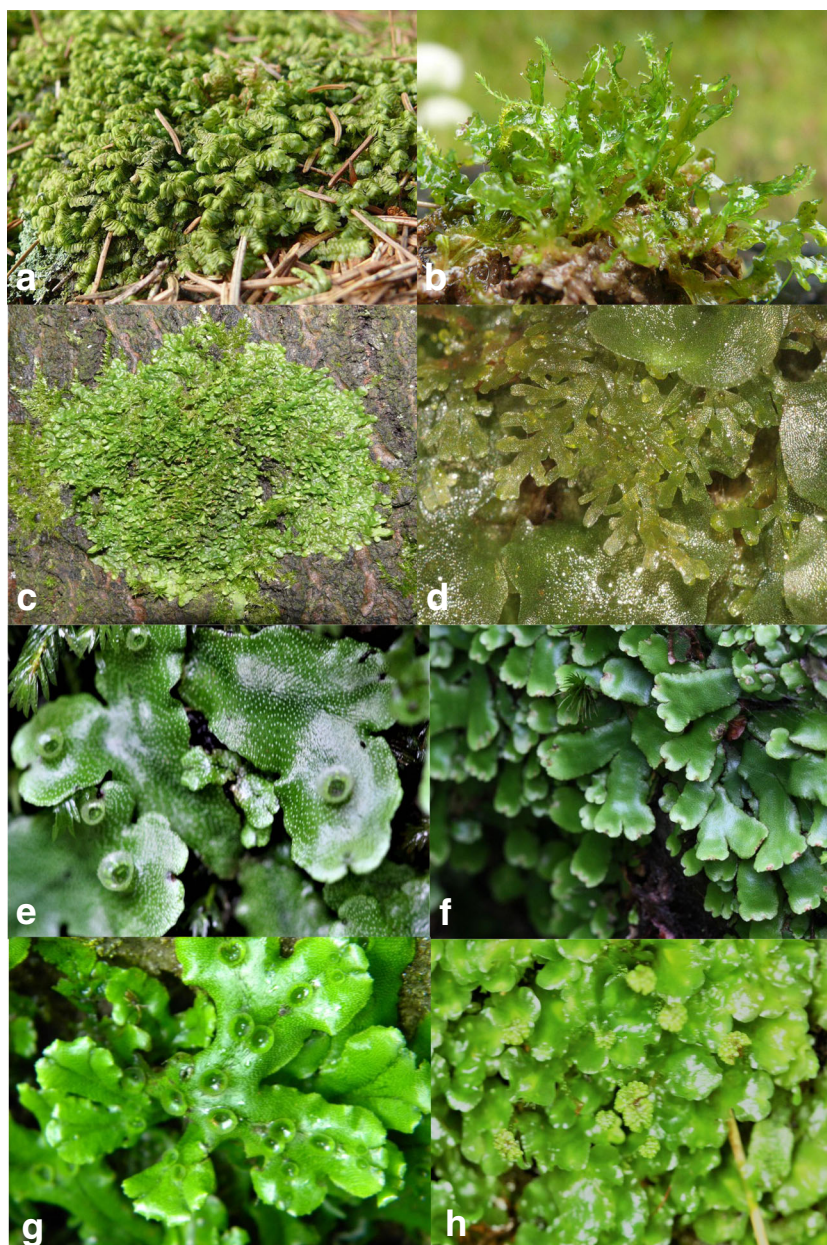
Fig. 1 Habits of few bioactive bryophytes; a. Bazzania trilobata , b. Blasia pusilla c. Radula complanata d. Riccardia multifida , e. Marchantia paleacea , f. M. polymorpha , g. M. papillata , h. Dumortiera hirsuta

2-(3-methyl-2-butenyl) bibenzyl [13], 3,3'-dimethoxy-4,5-methylenedioxy-4'-hydroxybibenzyl, 3,4,3',4'-dimethylene dioxybibenzyl, 3,3'-dimethoxy+methylene dioxybibenzyl and 3,3'-dihydroxy-4,5,4',5'-dimethylene dioxybibenzyl isolated from Frullania species, angustatin A from Asterella angusta [45], cavicularin isolated from Cavicularia densa Steph [46], isoplagiochins E, F, G, ptychantols A-C, isoperrotetin A [47] were reported with different medicinal properties. However, the following section depicts the medicinal efficacy of selected naturally derived and chemically synthesized bibenzyls and their derivatives, along with their sources and details of experimental methodologies.