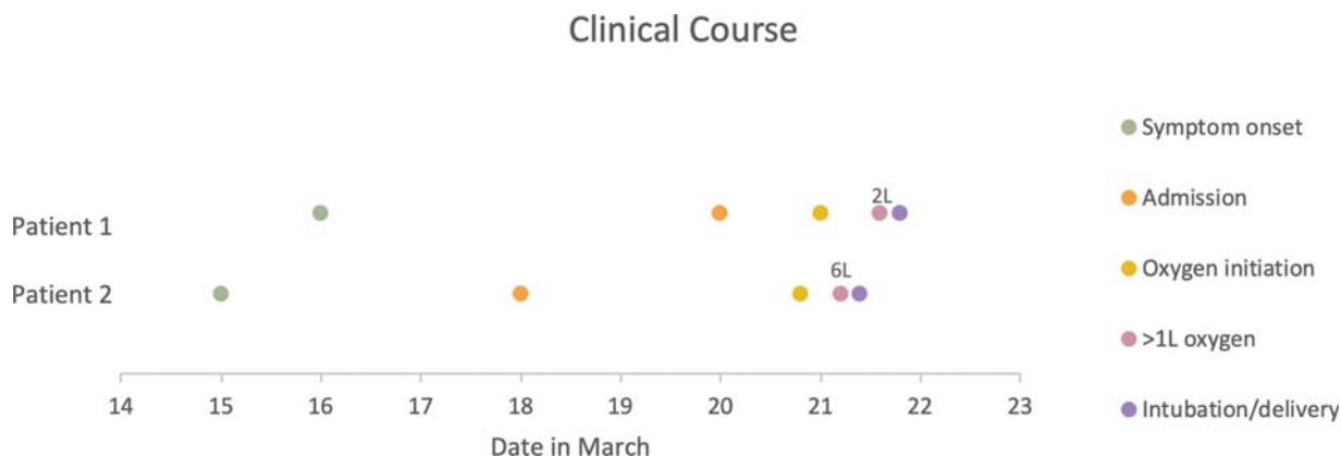
Fig. 2 Time course of clinical events.

BP, 116/65 mm Hg; HR, 102 bpm; RR, 20 breaths per minute; and SpO 2 , 97%. She was well-appearing and in no respiratory distress, with bilateral diffusely coarse breath sounds noted. Workup was initiated for upper respiratory tract pathogens including COVID-19 using Cobas SARS-CoV-2 RT-PCR under EUA, which was tested within the hospital laboratory. Initial laboratory evaluation demonstrated mild thrombocytopenia, mildly elevated aspartate aminotransferase, and elevated C-reactive protein, with normal leukocytes, absolute lymphocyte count, and carbon dioxide (►Table 2). Chest radiograph demonstrated patchy bilateral pulmonary and perihilar opacities with associated peribronchovascular thickening (►Fig. 3A). Lower extremity duplex ultrasound ruled out deep vein thrombosis, and electrocardiogram demonstrated sinus tachycardia. Fetal status was reassuring. She was admitted to the medicine service with ongoing consultation by maternal fetal medicine and initiated on azithromycin 500-mg IV daily and ceftriaxone 1-g IV daily (the latter due to her possible superimposed bacterial pneumonia seen on chest imaging).