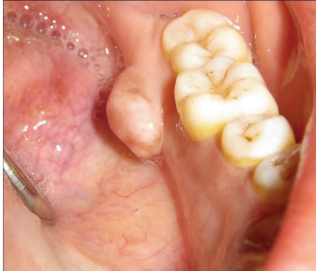
FIGURE 1: Intraoral picture of the lesion.