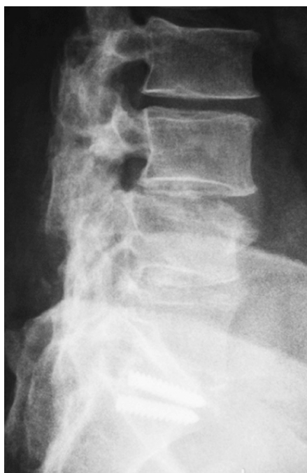
Fig. 1. A typical radiological example of “failed back surgery syndrome”: previous L4 to S1 posterolateral fusion with adjacent (L3–L4) segment degeneration, residual/recurrent neural involvement, broken screw instrumentation, and loss of lumbar lordosis.