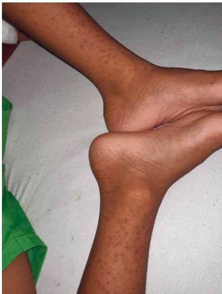
FIGURE 2: A photograph demonstrating classical nonblanching and a palpable purpuric rash over extensor surface of legs.

for the age and sex. The abdomen was soft and nontender without palpable masses or organomegaly. Nervous system examination revealed a conscious and well-oriented child with a Glasgow Coma Scale of 15/15. He had normal muscle tone and power in all four limbs with exaggerated deep tendon reflexes and extensor plantar response in bilateral lower limbs. His pupils, fundi, and cranial nerves were normal, and he did not have neck stiffness or Kernig's sign.