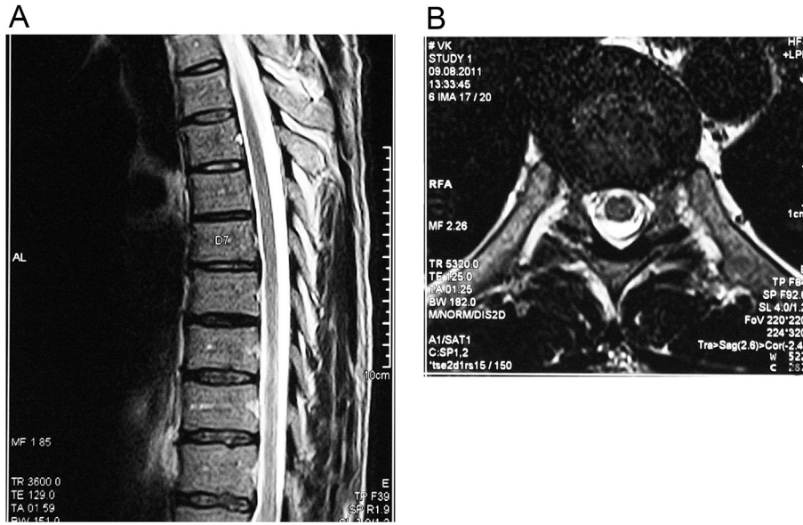
Fig. 3. (A) T2 weighted sagittal and (B) axial MRI scan showing the disappearance of the previously reported lesions.

the main reason for lower regression rate of TDHs. 10 In addition, calcified herniated discs, mainly interpreted as hard herniated discs, are difficult to resect during the surgery. 11 On the other hand, some of the TDHs, even if calcified on the preoperative imaging studies can be found to be soft and non-adherent intraoperatively, thus easily resectable. 11,12