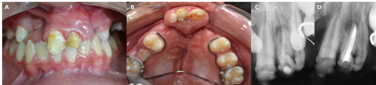
Figure 1. Clinical and radiographic exams. A) Intraoral clinical examination in frontal view, observing the upper arch; B) Evidencing the presence of cleft palate; C) Periapical radiograph, before primary endodontic treatment; D) After primary endodontic treatment

limitations and to provide higher resolution images, cone-beam computed tomography (CBCT) has been used as an efficient resource to identify and locate roots and additional canals in anomalous teeth [7]. Hence, this work aims to report the endodontic retreatment of a maxillary central incisor with two canals on a patient with cleft lip and palate.