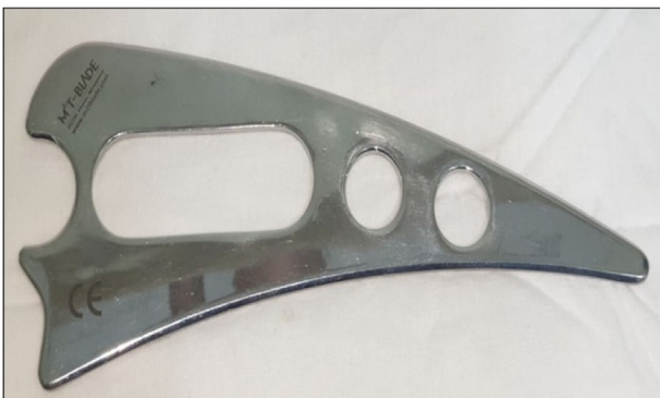
Figure 4: M2T blade