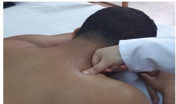
Figure 8: Stripping massage.