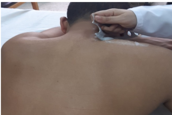
Figure 5: IASTM: sweeping technique. IASTM, instrument-assisted soft tissue mobilization.

In group A, there were significant differences between pre- and post-treatment values of all outcome measures, as shown in Table 2. VAS and ANDI scores decreased by 51% and 50%, respectively, while, PPT increased by 33%. In group (B) there were also significant difference between pre and post-treatment values of all outcome measures. VAS and ANDI scores decreased by 58% and 54%, respectively, while, PPT increased by 86%.