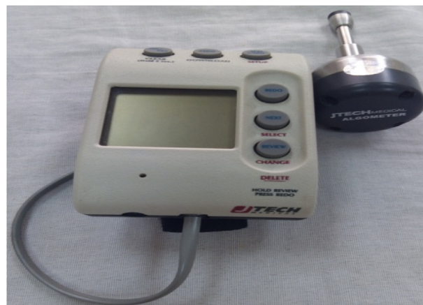
Figure 2: A Commander algometer.