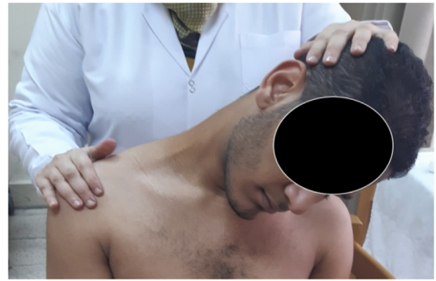
Figure 6: Passive stretching exercise