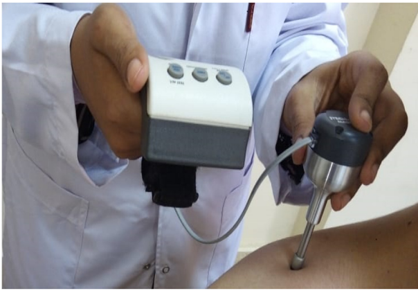
Figure 3: Pressure pain threshold assessment.