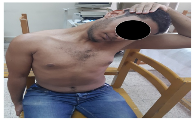
Figure 7: Self-stretching exercise.