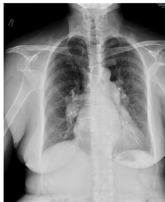
Figure 1 Chest radiograph demonstrating bilateral anterior shoulder dislocations.

The glenohumeral joint dislocation is the most common type of joint dislocation. Bilateral dislocations of the glenohumeral joint in posterior [10], inferior [11], and