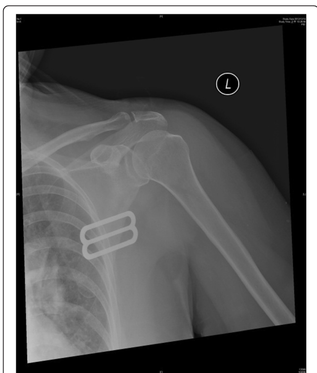
Figure 3 Left shoulder radiograph showing successful closed reduction.

and middle age women (mean age of 57.2 years), has a bimodal distribution [12]. The injury mechanism of unilateral anterior shoulder dislocation is forced extension, abduction, and external rotation. However, the mechanism necessary to produce bilateral injury is unusual [14], and is usually of traumatic origin. Other reported cases are caused by seizure, electrocution, hypoglycemic attack, and rheumatoid arthritis [15]. Ballesteros [12] followed Brown's classification and distinguished different etiologies of anterior shoulder dislocations in subcategories, including traumatic, lever mechanism, traction mechanism, push-on mechanism, unknown or complex mechanism, muscle contraction, and atraumatic.