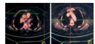
Figure 2: Positron emission tomography-computed tomography image post six cycles of paclitaxel and carboplatin chemotherapy showing near-complete metabolic resolution at left breast and complete metabolic resolution at right paratracheal lymph node

smooth muscle actin (SMA), and CD10. C-Kit was weakly expressed. The tumor was negative for estrogen receptor (ER), partial response (PR), and Her2/neu expression. Final report was myoepithelial carcinoma of breast, intermediate grade. Three-week postsurgery, she had noticed a new lump in her breast adjacent to previous incision. Positron emission tomography-computed tomography (PET-CT) scan [Figure 1] showed multiple ill-defined nodular masses in left breast parenchyma, largest nodule measured 2.1 cm × 2 cm. A 1.6 cm × 1.5 cm heterogeneously enhancing fluorodeoxyglucose (FDG) avid right paratracheal node was seen. Also noted was complete collapse of D1 vertebral body with FDG avid lytic areas in bilateral pedicles and left transverse process.