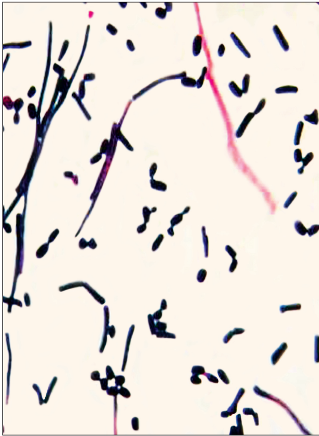
Figure 1) Colonies of Trichosporon asahii after 48 h on Columbia Blood agar at 35°C in ambient air. Morphological features of T asahii : T asahii is Gram-positive and produces blastoconidia of various shapes, well-developed hyphae, pseudohyphae and arthroconidia. (Gram stain, magnification \times 1000 )

Columbia Blood agar and China Blue Lactose agar at 35°C in ambient air and cultivated with a Bact/Alert3D Automated Blood Culture System (bioMérieux, France) for three days. Three weeks after surgery, the wound was debrided and resutured due to right knee wound dehiscence. Injectable vancomycin was administered for six days and, subsequently, the wound healed well. One month after the primary surgery, the patient presented with a persistent low-grade fever and recurrent pain on the right side of the left knee joint, which was accompanied by swelling. The temperature of the surrounding skin was also elevated.