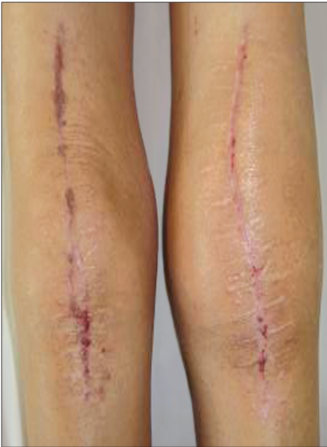
Figure 3) Gross morphology of the left knee 26 months after surgery. The left knee joint was mildly swollen