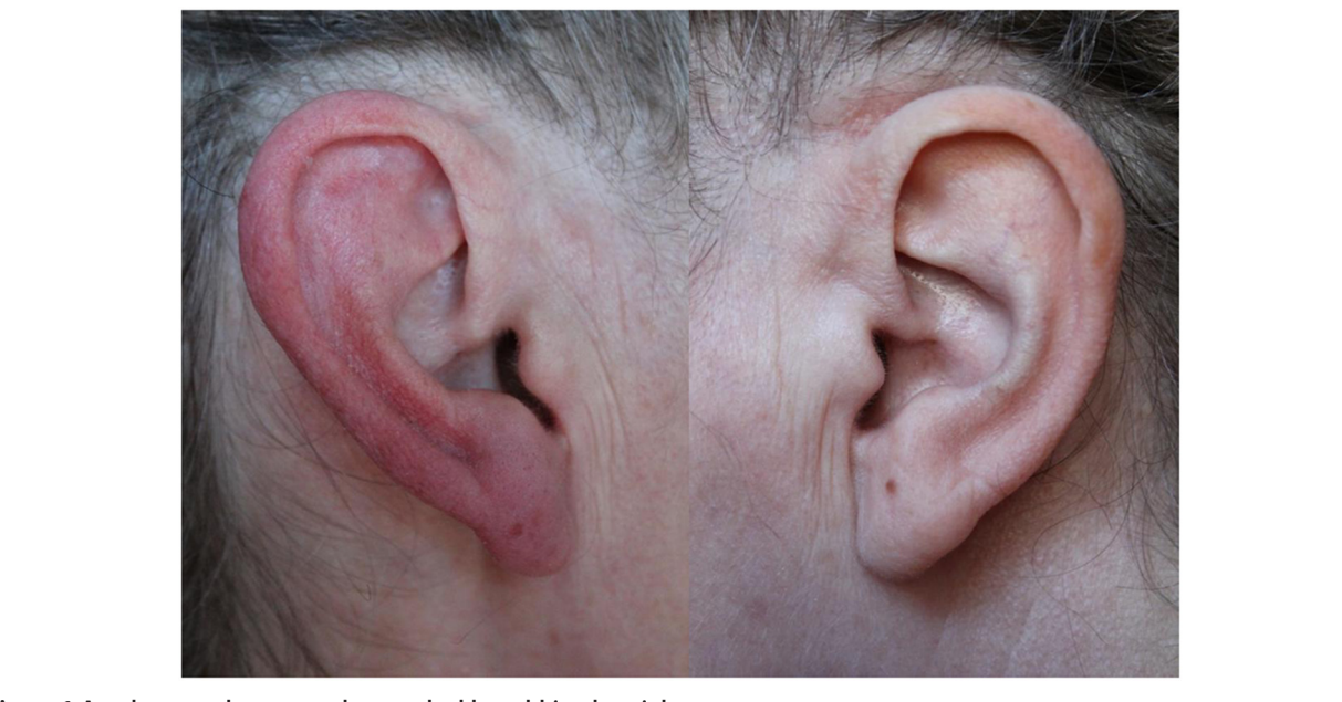
Figure 1 A red ear syndrome attack, provoked by rubbing her right ear.

In his original paper, Lance observed that RES was commonly associated with irritative lesions of the third cervical nerve root and this led him to suggest that, in cases