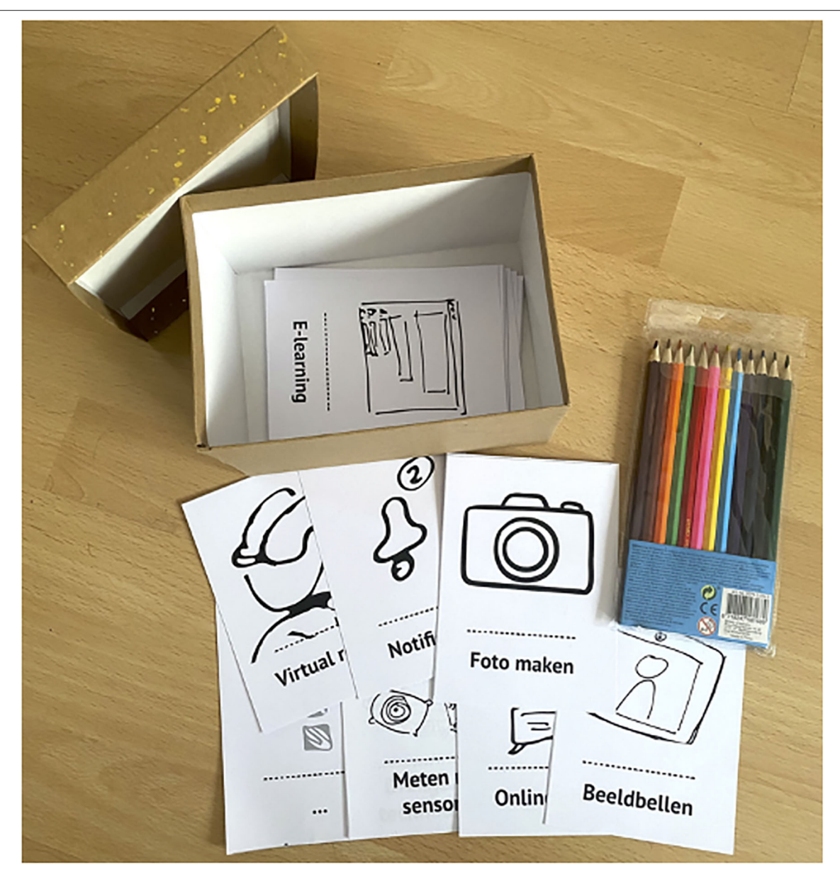
FIGURE 2 | Example of a tailor-made toolkit.

prototypes of the eHealth platform (e.g., a definitive decision on functionalities and scenarios how the platform is envisioned to be used).