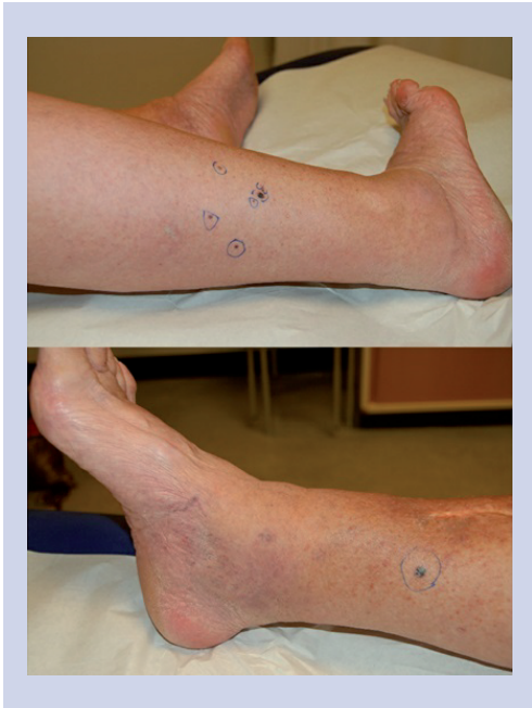
Figure 1. Melanoma patient with in-transit metastases eligible for CO 2 laser therapy.