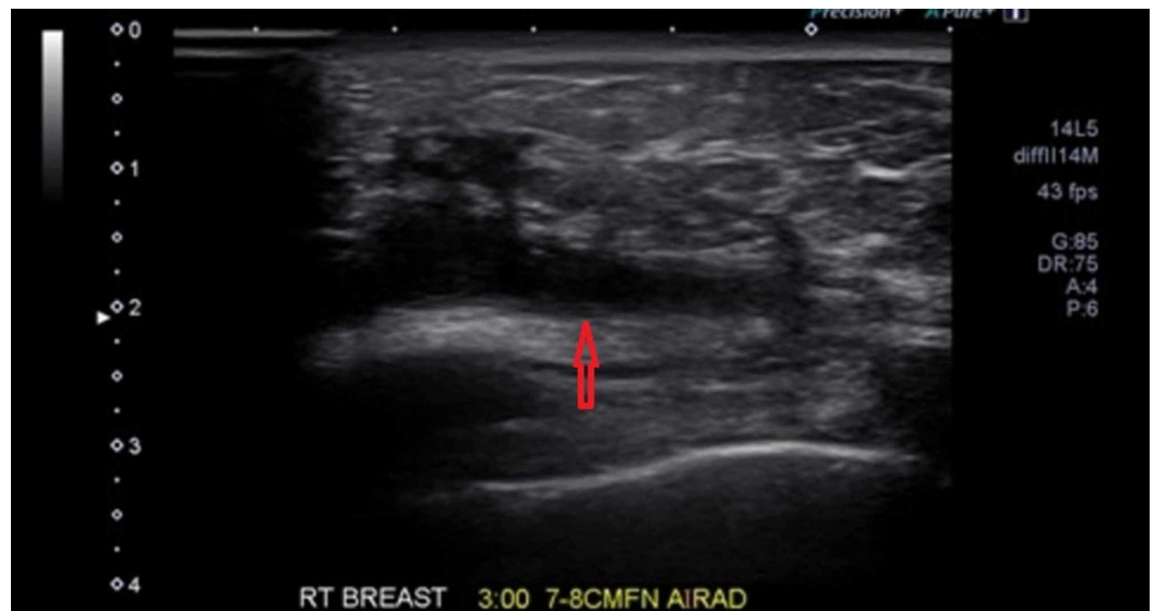
FIGURE 3: Breast ultrasound

Breast ultrasound (US) post incision and drainage (I&D) shows resolution of parenchymal fluid and confirmation of a persistent path between the I&D site and the biopsied granulomatous mastitis lesion (red arrow).