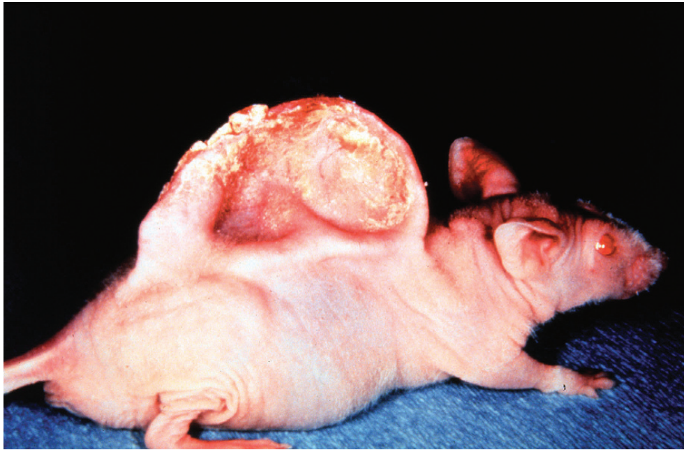
Fig. 1b Photograph of infamous mouse with the human ear, depicting new tissue-engineered cartilage generated in the shape of a human ear.

employing the principles of engineering in combination with the application of certain biological principles. Although regenerative medicine and tissue engineering share a common goal, that is, restoration of tissue or organ function, the means in which the goal is accomplished can be very different. Many facets of regenerative medicine may be accomplished by applying biologic principles without any consideration of any of the principles of engineering. Alternately, one may be able to engineer tissue with new functional attributes unrelated to a regenerative process. For these reasons, I do believe that the two fields are distinct, although an interactive relationship is beneficial to both efforts. At this time, I continue to believe that a journal dedicated specifically to tissue engineering is still quite appropriate.