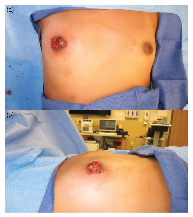
Figure 2. Using loop cautery, the angiofibroma was carefully, tangentially excised to the dermis of the skin. (a) Anterior view. (b) Lateral view.