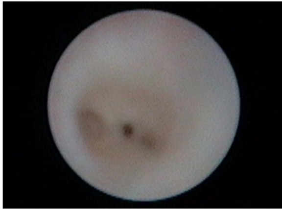
Fig. 3 Sialendoscopic photograph of right parotid primary duct stricture

the onset of the swelling, usually beginning 2–6 days after the trigger episode. This sign tends to fade in early stages if the behaviour is not protracted in time and is generally painless [18]. Histological examinations show changes within the parenchyma of the parotids, including hypertrophy of the cells and increased storage of adipose tissue [10, 14–16]. Hyposalivation is another typical feature reported in patients affected by both AN subtypes and BN, thus possibly concurring to the persistence of the glands inflammatory state. The genesis of this phenomenon could come from vomiting, starvation and antidepressant medications that have antisialagogue side effects. The appetite suppressant may also play a role in this pathological sign [2, 19]. Since this plethora of signs tend to subside after ED treatment and resolution, due to the inflammatory trigger removal, a step-by-step treatment approach should be followed: intensive pharmacological, sialendoscopic and then surgical approaches should be kept for refractory cases in long-history ED patients. Reports of effective sialogogue drug use such as pilocarpine, can be found in literature and could be used as primary treatment in such patients [20, 21].