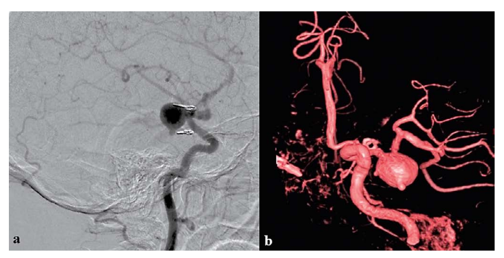
Fig. 3. Cerebral digital subtraction angiography (a), and 3D angiography (b), confirming the aneurysm fundus revascularization after correct placement of two aneurysmal clips.

clips) from previous surgeries (Fig. 1 b, c). Axial CT angiography (CTA) of the cerebral vessels revealed extensive aneurysm recurrence on the M1 segment of the left MCA after the initial clipping, measuring 16 mm in diameter (Fig. 2). The patient underwent left-sided pterional re-craniotomy, aneurysm neck remodeling and additional clip placement.