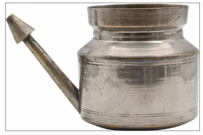
Figure 2: The neti-pot used for the nasal saline wash

Satomura et al. <sup>[8]</sup> found a reduced incidence of influenza in healthy adult volunteers practicing oral gargles versus those who did not practice gargles. Similarly, Noda et al. <sup>[9]</sup> noted a reduced incidence of fever in school going children practicing gargles versus those who were not. Fever was taken as marker of URTI in this age group in Japan. These Japanese studies analyzing the role of oral gargles noted reduced incidence rates of influenza in healthy adult and elderly volunteers, but not in teenage volunteers.<sup>[8,10,11]</sup>