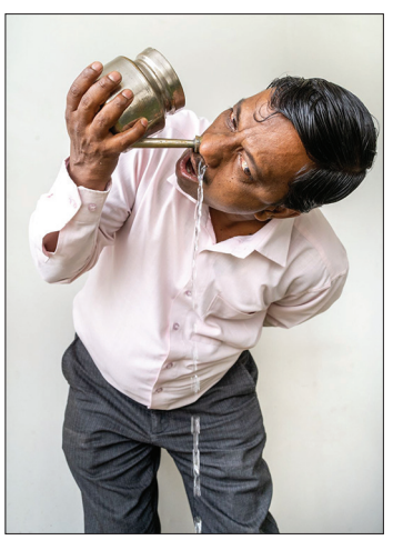
Figure 3: Demonstration of the technique of nasal saline wash. The stream of saline water is flushed through one nostril and drained through the other with help of gravity; all throughout the process the person breathes through the mouth

Saline is also used in washing and cleaning wounds traditionally. Probably, this therapy may also act similarly