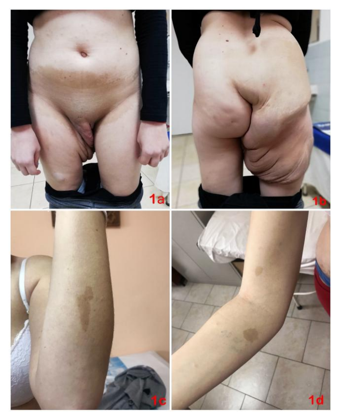
Figure 1: A), B) Clinical examination: in the area of the genitals, the gluteal region and the upper medial part of the right hip, a plexiform tumour-like formation with a darker-skin-colour appearance, which resembles clinically as "worm bag" (Figures 1a and 1b) was observed; C), D): Clinical view of numerous café-au-lait spots on the skin of the upper limbs

We present a 25-year-old woman with a family history for neurofibromatosis type 1. According to anamnestic data, father and grandmother suffer from neurofibromatosis type 1, as in the grandmother being observed lethal outcome as a result of the transition from plexiform neurofibroma to neurofibrosarcoma in the neck area. The first symptoms date back to the age of 2-3 when multiple café-au- lait spots were observed all over the body and appearance of tumour formation in the neck and genital area (Figures 1a-1d). At the age of 3 labiaplasties were performed on the pubic lips. By entering puberty, tumour formations in the neck area and genitals begin to increase in size. In 2015, the patient was hospitalised in a plastic-restorative and aesthetic surgery department, where step by step the skin and some parts of the plexiform neurofibromas in the lumbosacral, the sciatic, genital, and upper-medial area of the right thigh have been removed.