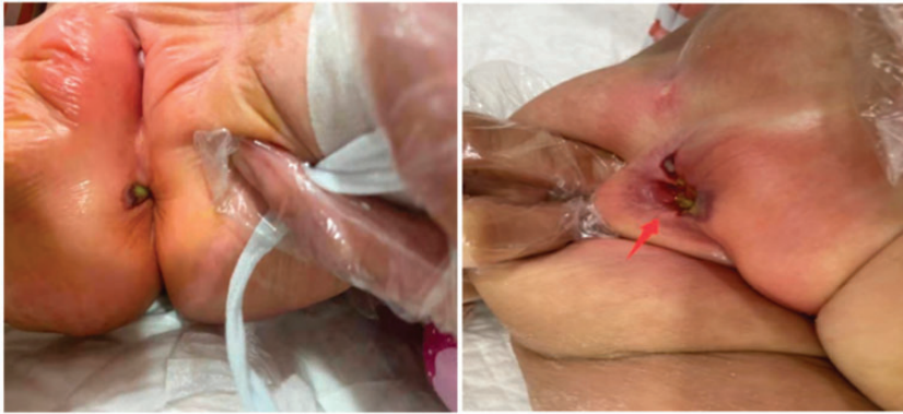
Figure 2. Ecthyma gangrenosum in the perianal area of the patient.