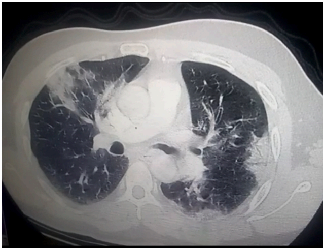
Fig. 1. Cross-section of thoracic CT scan, in favor of a sars-cov-2 pneumonia with a 40% lung damage.