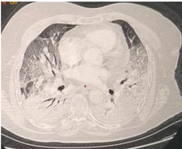
Fig. 2. Cross-section of thoracic CT scan, in favor of sars-cov-2 pneumonia with lung damage more than 75%.

4000–10.000/ \mu l), C-reactive protein at 231 mg/l (normal between 0.00 and 5.00 mg/l), IL-6 at 1601 pg/ml (normal less than 7 pg/ml), fibrinogen level at 5.4 g/l, procalcitonin less than 0,05 ng/ml, the rest without particularity.