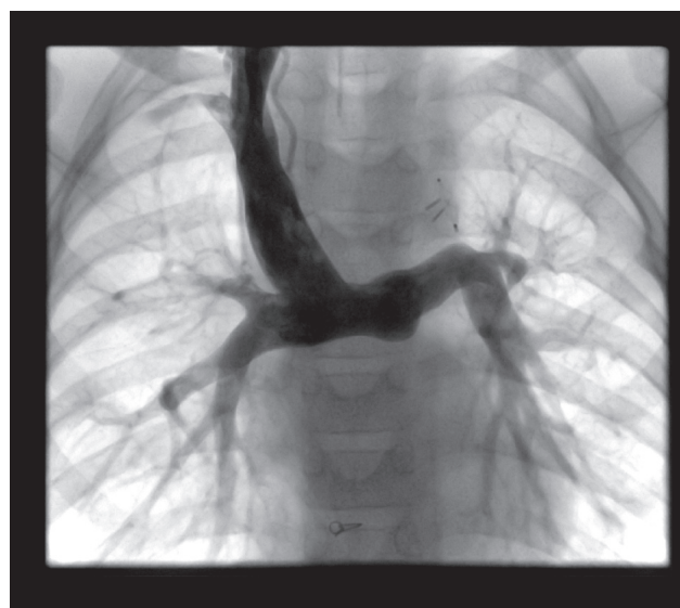
Fig. 1. A 6-year-old patient after a Glenn procedure. The additional left superior vena cava is closed by Amplatzer Vascular Plug 4

One solution for chronic insufficient preload of the single ventricle is the creation of a so-called fenestration (Fig. 2), i.e., a small connection between the systemic venous system and the atrium of the systemic ventricle, performed during the last stage of the surgical treatment. This serves a double purpose. On the one hand, the fenestration becomes a “safety valve” in case of an excessive pressure rise in the systemic venous system; on the other, the additional shunt increases the preload of the single ventricle as well as cardiac output. Although the addition of blood from systemic veins to blood flowing from pulmonary veins causes a slight desaturation in the aorta (optimally to ap-