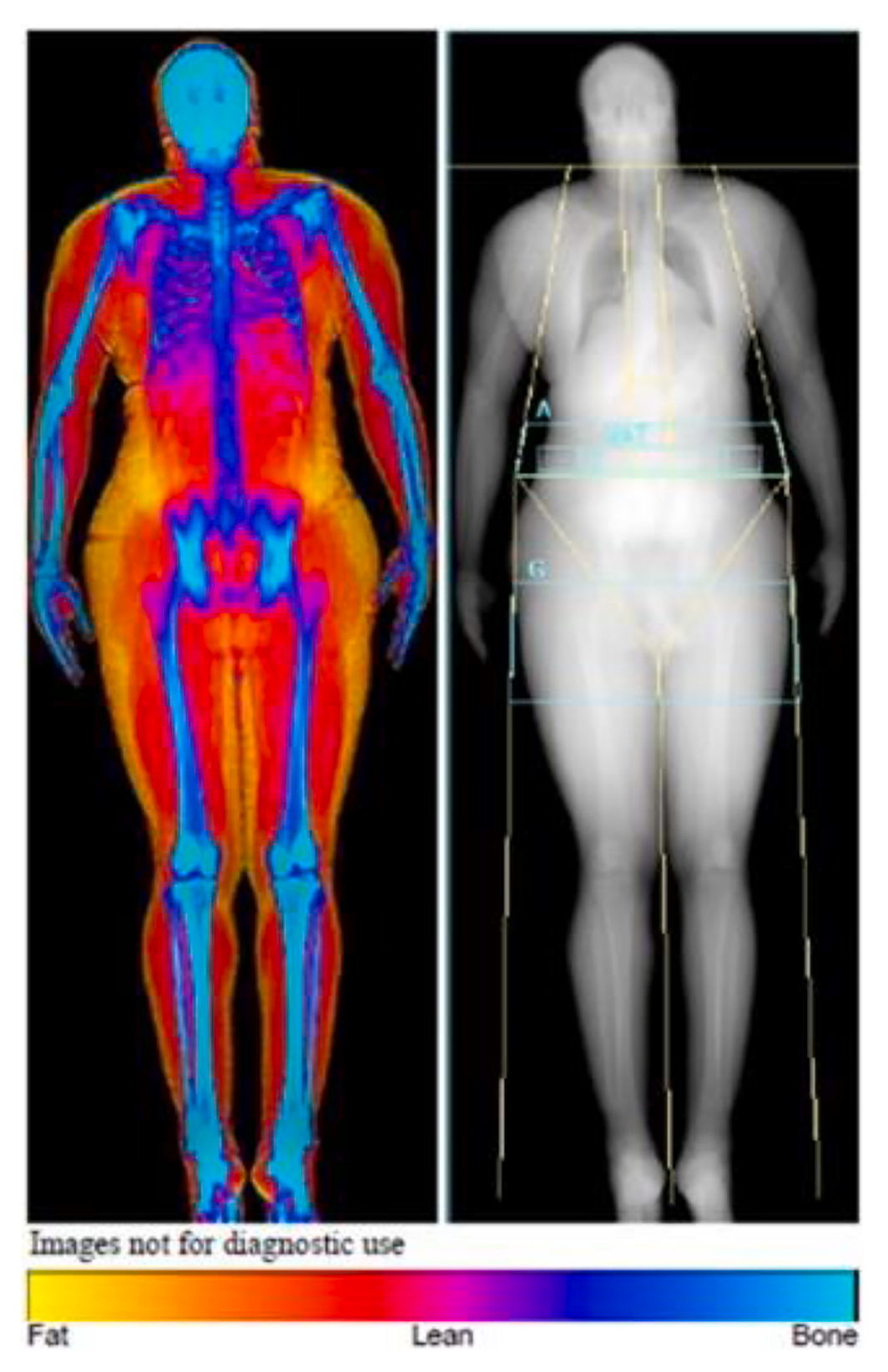
Fig. 1. An example of a post-processed whole body DXA scan. Fat is represented in yellow, bone in blue, and muscle in red [16]. (For interpretation of the references to colour in this figure legend, the reader is referred to the web version of this article.)

onset of puberty has a wide range of 5 years; it varies from age 8–13 years old in females, and 9–14 years old in males. The tempo of progression in secondary sexual characteristics as well as peak growth velocity also vary amongst individuals [25]