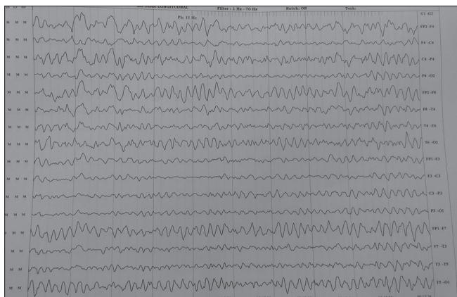
Figure 1: Electroencephalogram showing diffuse slow wave activity