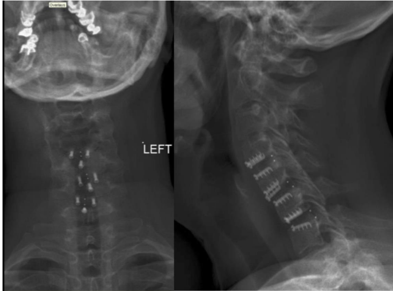
Fig. 1. Postoperative anteroposterior and lateral radiographs showing cervical disc arthroplasty implants at C4-5, C5-6 and C6-7.

When the patient had adequately regained consciousness from anaesthesia she complained of a headache, diplopia and left sided weakness. On examination she was found to have 3/5 power on the Medical Research Council scale 8 in the left arm and leg. Given these symptoms an urgent MRI of the brain and cervical spine were obtained. A large left inferior cerebellar signal abnormality indicating a cerebellar infarct or ischemia with some abnormal signal in the adjacent brainstem was found (Figure 2). MRI imaging of the cervical spine showed satisfactory decompression of the cord and foramina and no changes in the cord itself. Subsequently carotid and vertebral artery angiography and carotid doppler examinations were performed and were reported by the radiologists as showing patent carotid and vertebral vessels with no structural abnormalities and a patent Circle of Willis (Figure 3). Transthoracic cardiac echocardiogram did not reveal any thrombus.