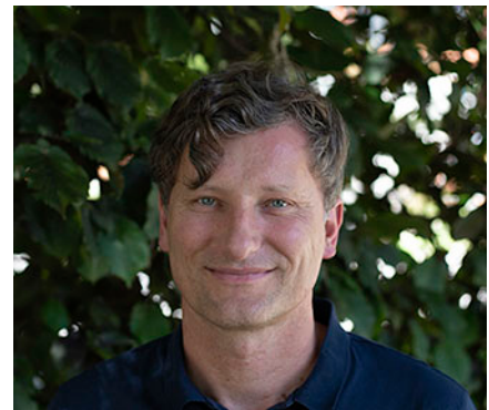
Insights from Marcus Conrad.

Ward et al. (2020) now demonstrate that on a p53 wild-type background, NNT expression significantly contributes to increased tumor burden, while on a p53-deficient background, tumor initiation was