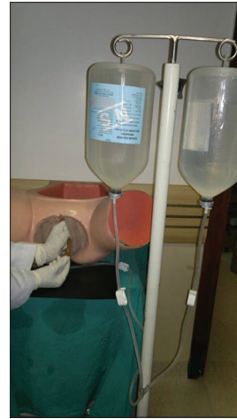
Figure 4: This figure shows complete procedure being done

Once the diagnosis of inversion is made, measures should be undertaken to manage and correct acute blood loss and potential shock. In conjunction with anesthesia personnel, immediate uterine replacement should be considered. Immediate recognition and early treatment to relax the cervico-uterine junction should ensure rapid replacement of the uterus. Manual repositioning of uterus under anesthesia is immediately recommended, [2] if there is a delay in anesthesia and patient is in profound shock (or even if the manual replacement has failed), O'Sullivan's hydrostatic replacement technique can be remarkable and is gratifyingly effective and is to be undertaken. [6-8] If done properly is always successful and it avoids the risk of anesthesia and reduces maternal morbidity and mortality. The challenge in O'Sullivan's method is in developing a water seal. Use of 1 L bags of warmed saline with a pressure infusion pump is usually recommended, but small saline bottles need to be replaced quickly and to create pressure by pump requires a longer time. Some workers have modified this technique by attaching the tubing to a silastic vacuum extractor cup, which is placed inside the introitus and might help provide a better seal. [9] We modified this technique by using a trans-urethral resection of prostate set (TURP set), used in endoscopic resection of prostate and two 3 L warm saline bags with success.