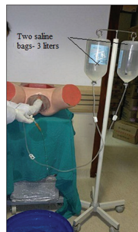
Figure 2: Trans-urethral resection of prostate set being connected to large saline bottles and regulators made open so there is egress of saline