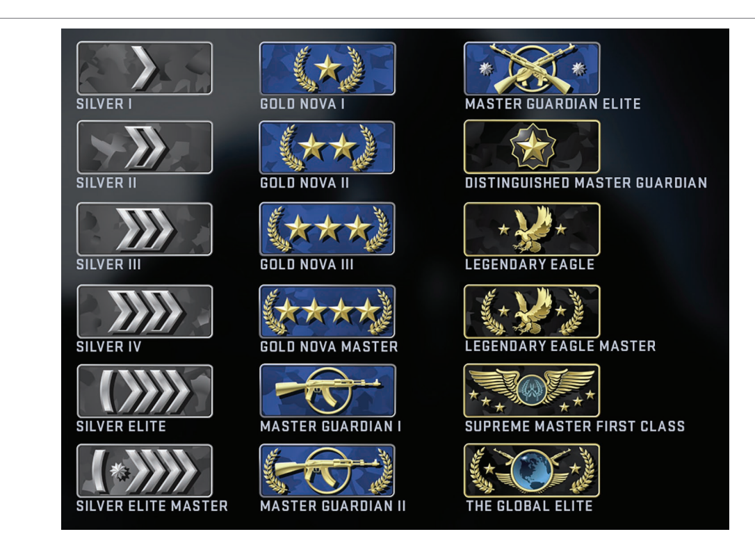
FIGURE 2 | The 18 current competitive skill rankings for first-person shooter esports game, Counter-Strike:Global Offensive (CS:GO).