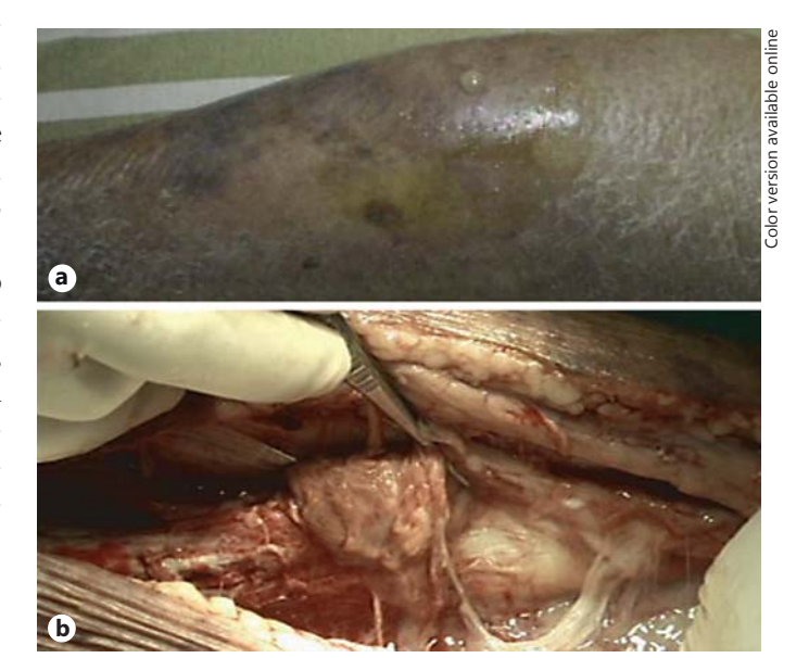
Fig. 2. A 90-year-old female with a history of diabetes mellitus and chronic renal insufficiency had left lower leg pain for 2 days. a The left lower leg revealed patchy purpura and edema in the emergency room. b After fasciotomy, the lower leg showed yellowish pus accumulated in the fascia and muscular layer. Above-the-knee amputation was performed immediately. The cultured specimen confirmed K. pneumoniae ; however, this patient died on the sixteenth day after admission owing to progressive septic shock and multiple organ failure.