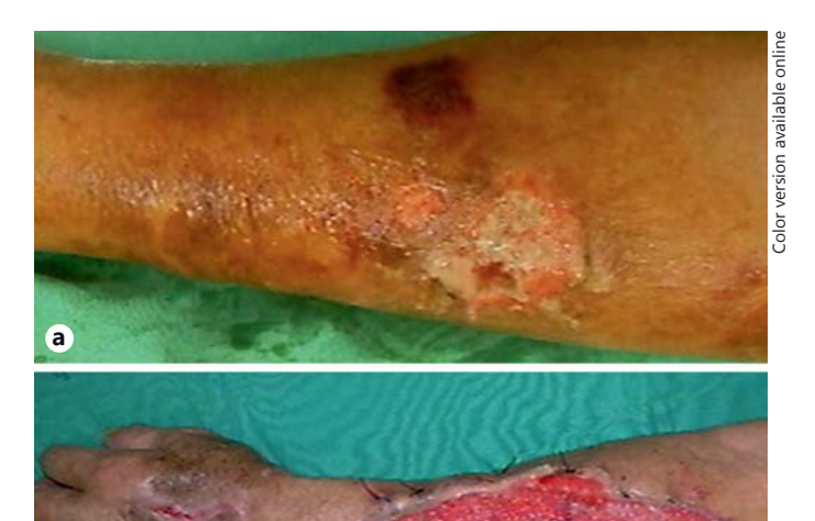
Fig. 1. A 73-year-old male with a history of hepatitis B and diabetes mellitus had left forearm and hand pain on the second day after a cutting injury. a Preoperative photographs of the left hand revealed skin erosion, vesicles, and subcutaneous bleeding. b After an emergency fasciotomy, a wound culture confirmed the presence of A. hydrophila . He received a skin graft on the thirtieth day after fasciotomy.

Of the 7 patients in the K. pneumoniae group, 6 were men and 1 was a woman, with a mean age of 59.9 \pm 19.6 years (range 40-90). Three patients had acquired abrasion wounds while working, and 1 had previous chronic ulcers. One patient had had contact with seawater, and 2 did not recall any injuries. Three patients died a mean of 27.7 \pm 27.4 days after admission, and the all-cause in-hospital mortality rate was 42.8% (tables 3, 4).