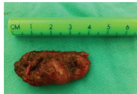
FIGURE 4: The cyst excised measures 4 × 2 cm.

the differentiation of ductal atresia from duplication anomalies of ductal system [6]. A fine-needle aspiration biopsy shows the mucus with inflammatory cells; in addition the biochemical analysis of aspiration fluid reveals high protein and amylase contents. Interestingly congenital lesions can now be diagnosed prenatally by ultrasonography and an EXIT (exutero-intrapartum treatment) procedure may be followed for treatment in such cases [7, 8].