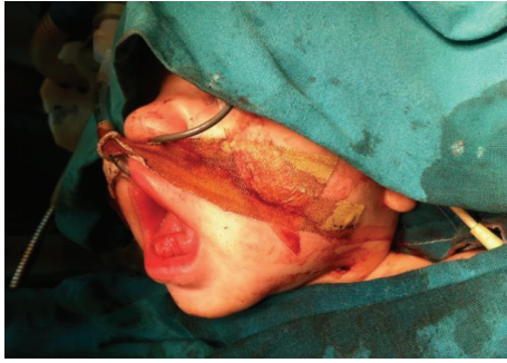
FIGURE 5: Marked reduction in the size of the mouth after excision of the cyst.