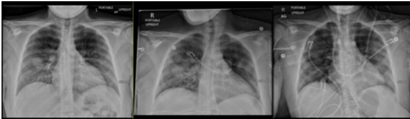
Figure 1 Disease progression on chest X-ray (day 4, day 6, day 14 of symptoms, respectively).

declined again. CXR demonstrated progression of the bilateral opacities. Fetal monitoring identified repeated heart rate deceleration and tachycardia up to 170 BPM that was unresponsive to fluid resuscitation. Convalescent plasma was administered. Despite a rise in her inflammatory markers, treatment with remdesivir and tocilizumab was declined because of their unknown impact on the fetus.