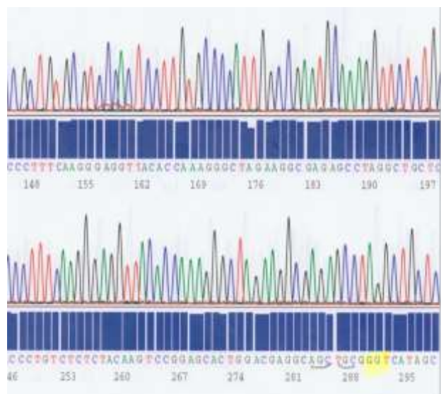
Figure2. A part of chromatograph patterns with intact AR gene sequences in our patient.