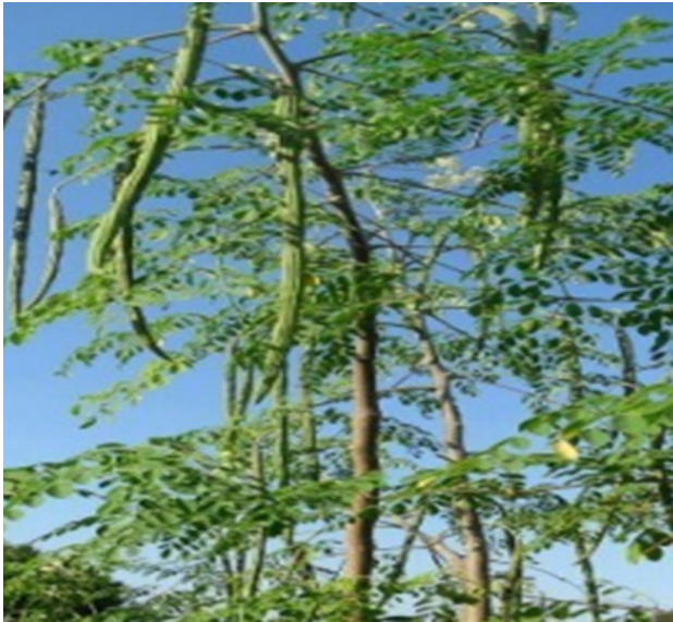
Figure 1 Plant of Moringa oleifera Lam.

times the vitamin A of carrots, 15 times the potassium of bananas, 17 times the calcium of milk, 12 times the vitamin C of oranges and 25 times the iron of spinach. Antioxidants galore and plant leaves of munga contains rich source of antioxidants, including beta carotene, vitamin c, quercetin and chlorogenic acid. Chlorogenic acid has been found to lower blood sugar levels [2]. The leaves and seeds of Moringa oleifera Lam. may protect against some effects of the arsenic toxicity which is especially important light of news. Contamination of ground water by arsenic has also become a cause of global public health concern. Moringa oleifera seeds have even been found to work better for water purification function [3]. From a digestive point of view the plant Moringa oleifera Lam. is highly rich in fibers that as the epoch times put it works like a mop in your intestines, to clean up any of that extra grunge left over from a greasy diet and also noteworthy are its isothiocyanates, which have anti- bacterial activity that may help to rid your body of H. pylori, bacteria implicated in gastritis ulcers, and gastric cancer.