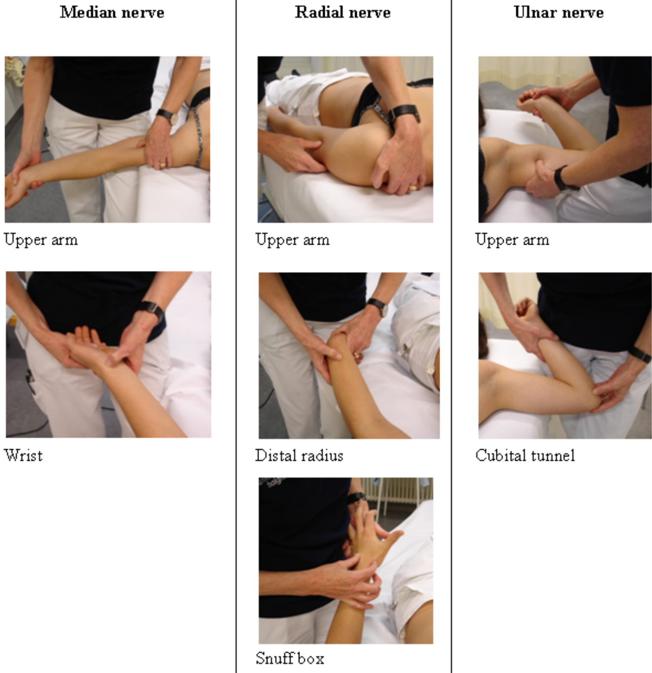
Figure 2 Peripheral nerve palpation points.