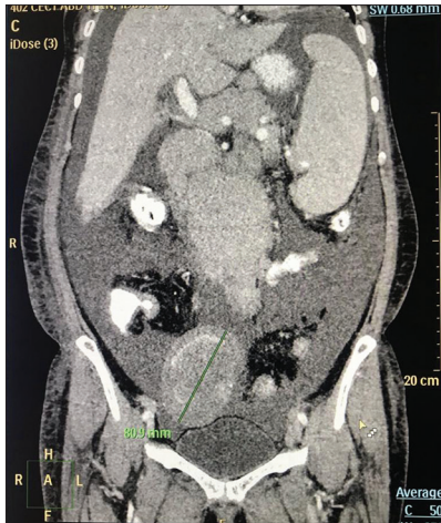
Figure 1: Conglomerate lymph node mass in the detected in the peri-pancreatic region and in the root of the mesentery with discrete nodes in the porta, along celiac axis. Large mass lesion detected in the right hypogastrium extending towards right adnexa